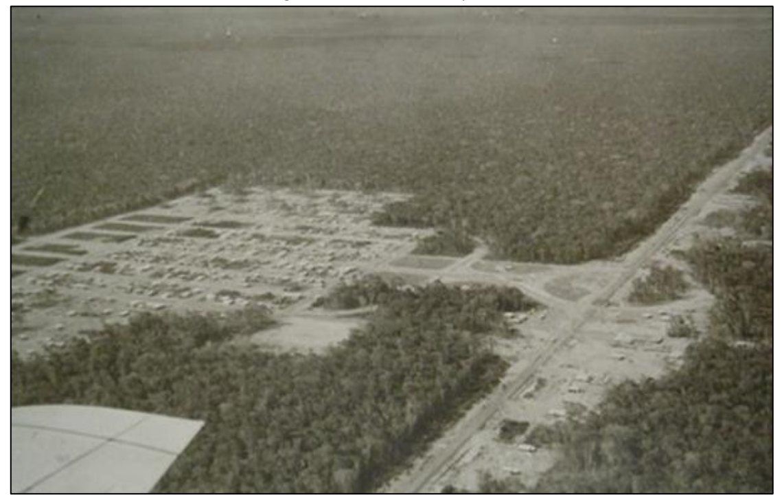
Figure 1 - Aerial view of Sinop 1974.

The city of Sinop is classified as a planned city, with recent settlement (1974), illustrated by Fig. 1, developing from a nucleus of new occupation, with an urban layout with wide streets and avenues. Coy et al. (2020) describes that in the first few years the urban boundaries drawn up by the colonizing company were exceeded, and the development of the city shifted to the occupation of the area known as the "green belt", which was overlaid by areas of residential allotments.