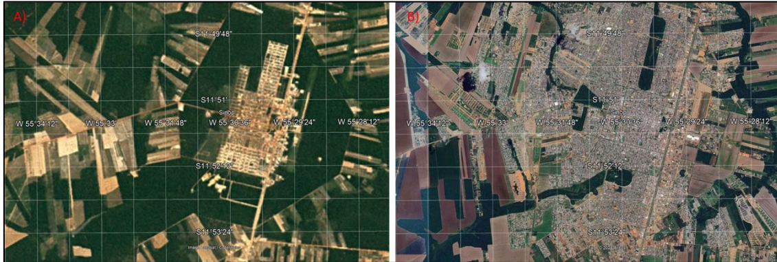
Figure 4 - Top view of the city of Sinop in 1985 (A) and 2024 (B).