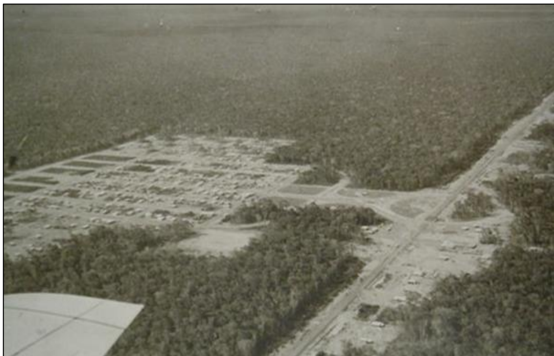
Figure 1 - Aerial view of Sinop 1974.

The city of Sinop is classified as a planned city, with recent settlement (1974), illustrated by Fig. 1, developing from a nucleus of new occupation, with an urban layout with wide streets and avenues. Coy et al. (2020) describes that in the first few years the urban boundaries drawn up by the colonizing company were exceeded, and the development of the city shifted to the occupation of the area known as the "green belt", which was overlaid by areas of residential allotments.