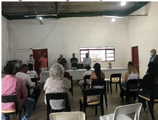
Figure 12 - Meeting at Associação Nélia Mabel to inform about the housing program "Pode Entrar", 2021.