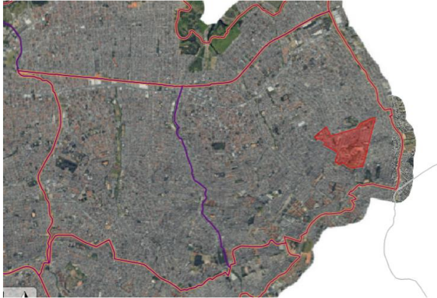
Figure 1. Encosta Norte set, in red, inserted in the Subprefecture of Itaim Paulista, São Paulo.