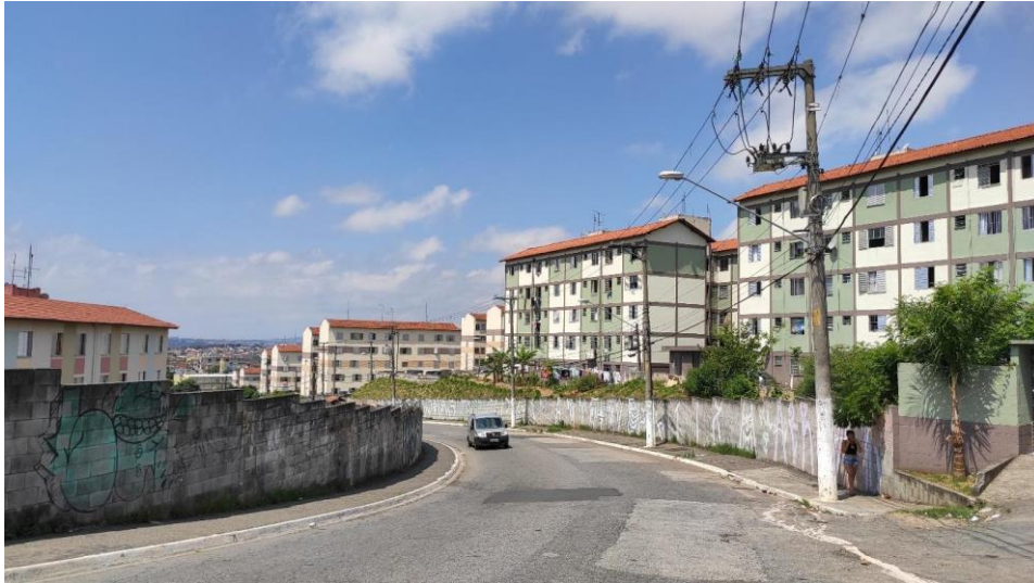
Figure 10 - Typology PI22-F implanted in phase E8 of the Encosta Norte complex.