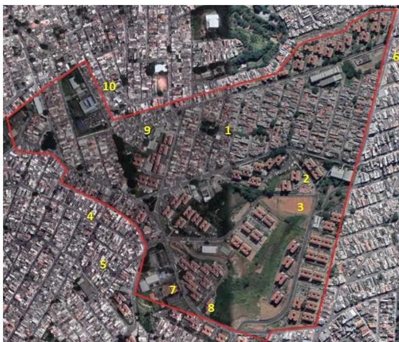
Figure 5 - Location of associations and occupations: 1) Old community center; 2) Encosta Samba and Solidary Football Community; 3) Pirelli Arena; 4) Nélia Mabel Association; 5) GRRC Bloco do Encosta and Team Bloco do Encosta; 6). Voluntary Women Community; 9) Jagatá Community; 10) Tijuco Preto Community.