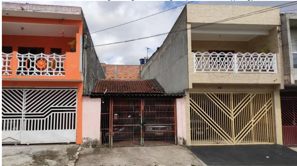
Figure 11 - Typology 011/87 in the original conformation, implanted in phase E1 of the Encosta Norte Set, and extensions of the neighboring houses, originally in the same typology.