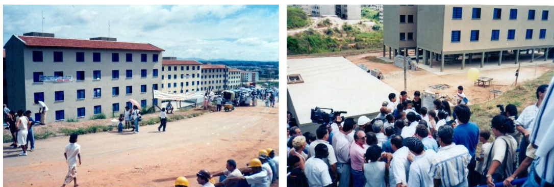
Figure 4 - Inauguration of phase E8 of Conjunto Encosta Norte in a self-management joint effort: CEP, Movimento Sem Terra and Pastoral da Moradia.