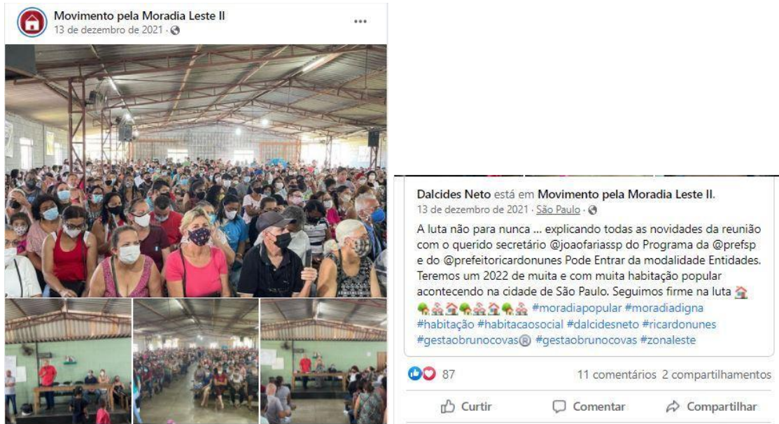
Figure 6 - Website of the Movement for Housing East II.