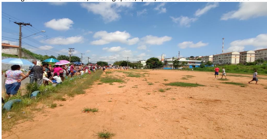
Figure 13 - Pirelli Arena, meeting space, sport, food collection and distribution.

Source: Photo by the authors, 2020, photo before the Covid-19 pandemic.