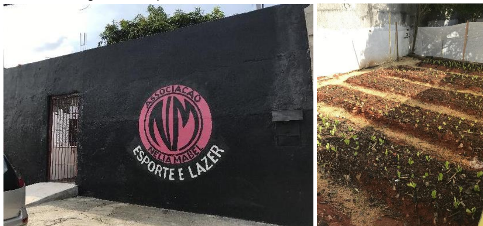
Figure 7 - Headquarters of the Nélia Mabel Association, 2021.