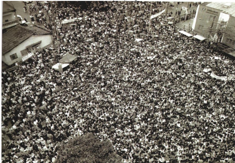
Figure 2 - Assembly of the Pastoral of Land and Housing held in 1987 in front of the Matriz de São Miguel with more than 20,000 people gathered.