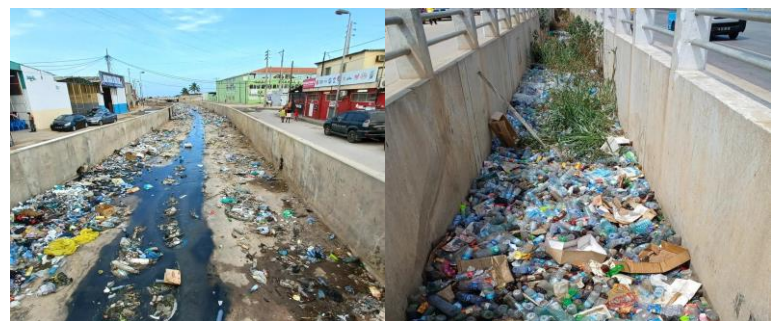
Figure 1 - Ditches with USW in the Samba region, a district of Luanda, capital city of Angola, 2023.

Figure 1 below shows examples of outdoor disposal in rainwater drainage ditches. In the province of Luanda, storm drains or what are commonly referred to as " bueiros " or " bocas de lobo " in Brazil are called " esgoto " (sewer) by the local residents.