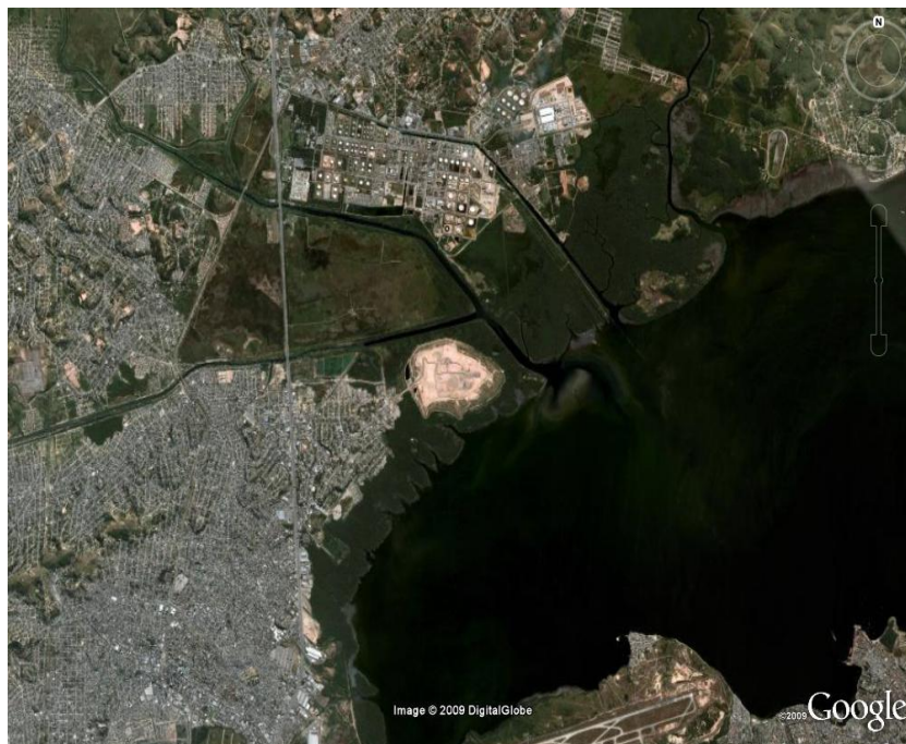
Figure 6 - Google map showing the waste peninsula, the Guanabara bay and the estuary.