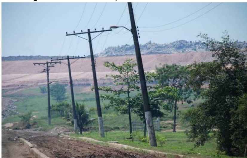
Figure 4 – Long roads and distant open areas

The detailed job of sorting out 4 different types of paper, 130 types of plastic, during the above mentioned 12 hours a day involves different kinds of labour. Study carried out by the State University (UERJ) indicates an estimated figure of 30.000 people living, directly or indirectly, on jobs related to recycling the waste collected by 900 trucks employed by the Local Authority to bring everyday to Gramacho.