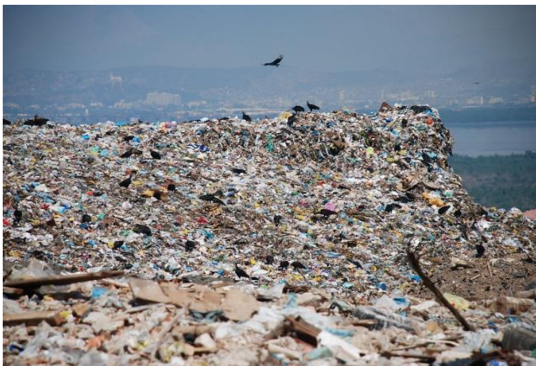
Figure 2 - Unstable mountain of solid waste in the landfill of Gramacho

The landfill of Aterro Metropolitano de Jardim Gramacho (Metropolitan Landfill of Gramacho Garden), is the biggest in Latin America, with 1,3 million square metres and a 100 million tons of accumulated waste and environmental hazards.