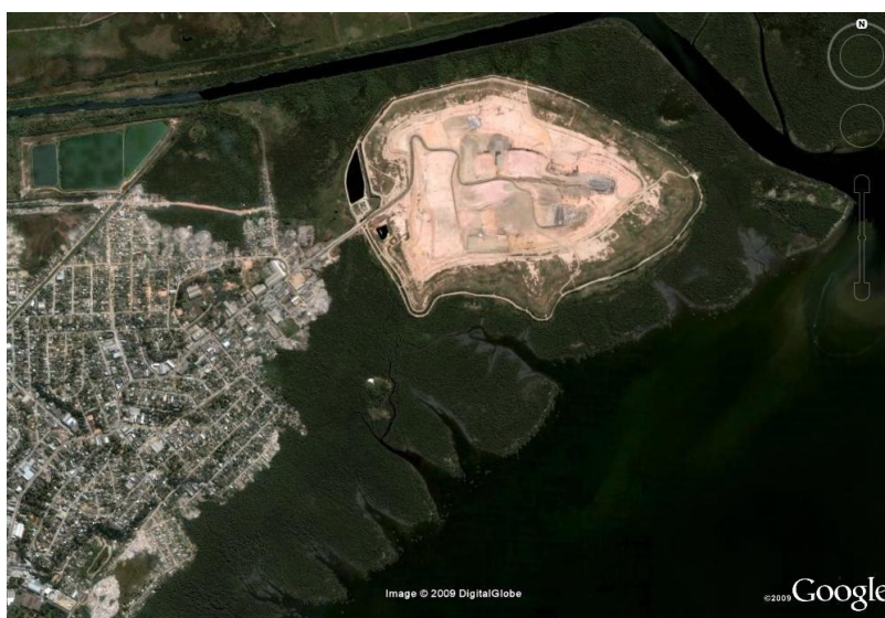
Figure 3 - A bird's eye view of the waste peninsula with neighbour settlement of Jardim Gramacho.