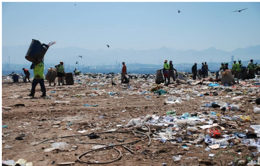
Figure 5 – Adventures and nightmares