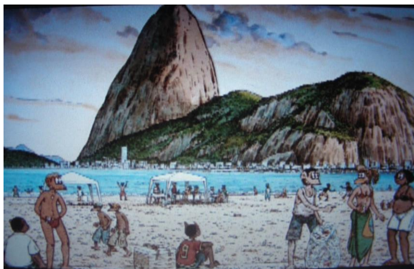
Figure 8 – Copy of a photogram showing uncollected residues spread around the beach and the collector of tins for recycling doing his job with the Sugar Loaf, one of the icons of Rio de Janeiro’s natural heritage, in the background

Source: Photogram extracted from the film made by the French cartoonist, Janus, “ Le Rio de Janus ”,