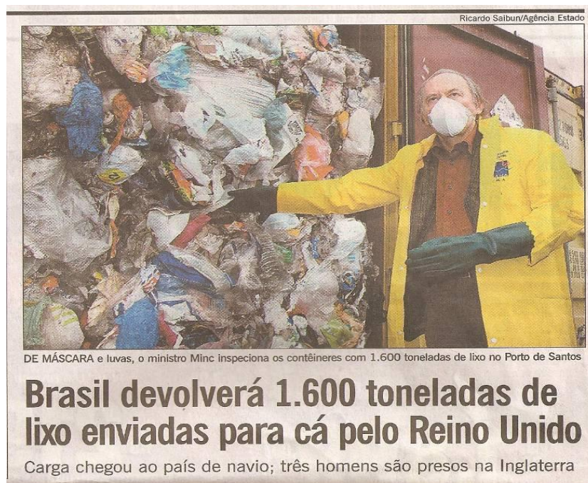
Figure 11 - Headlines of a Brazilian newspaper says that Brazil will give back 1.600 tons of waste ‘exported’ by the UK. The photo beneath shows the Brazilian Minister of Environment indicating the evidence.