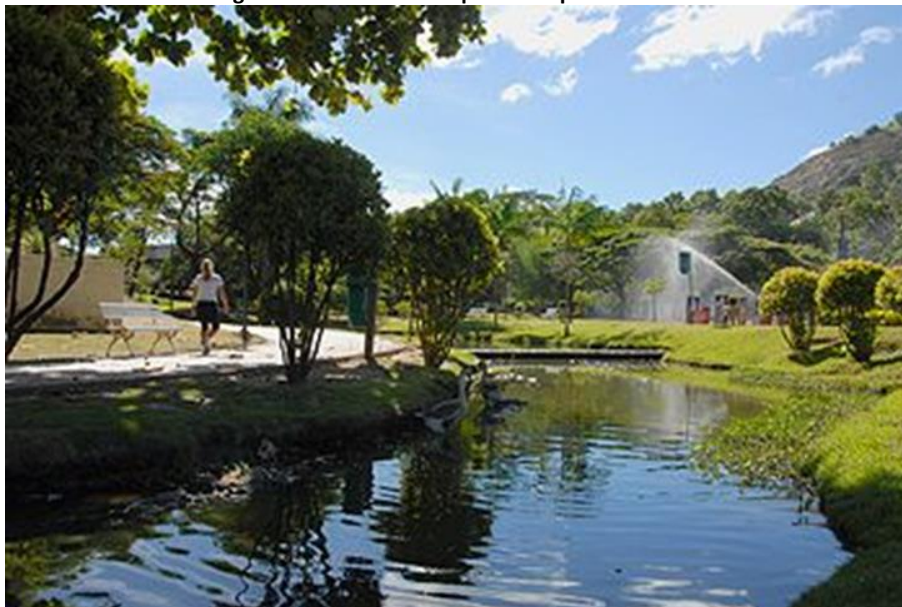
Figure 5: Horto de Maruípe Municipal Park - lake

For Andrade, the city government sought to recreate a green area with great diversification of plant species, mainly from the Atlantic Forest, where educational, cultural and leisure activities can be developed with the population. (ANDRADE, 2008). In the same period, Paysan stated that the garden receives more than 2500 people daily and on weekends this number doubles, which confirms the importance of the area for the population (PAYSAN, 2007, S3).