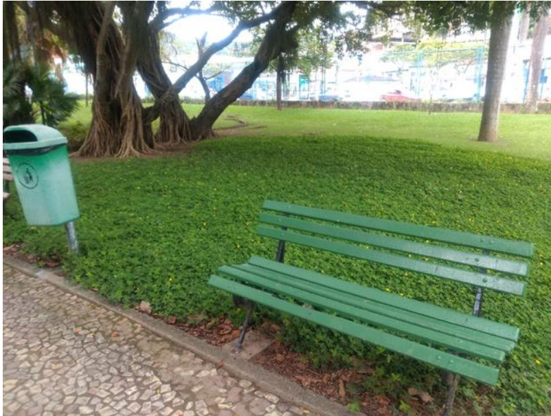
Figure 8: Horto de Maruípe Municipal Park - garden next to Maruípe Avenue

The botanical collection of the Horto de Maruípe Municipal Park is predominantly of species from the Atlantic Forest, as well as species adapted to our climate. (MARVILLA and GRIGATO, 1998, p. 31).