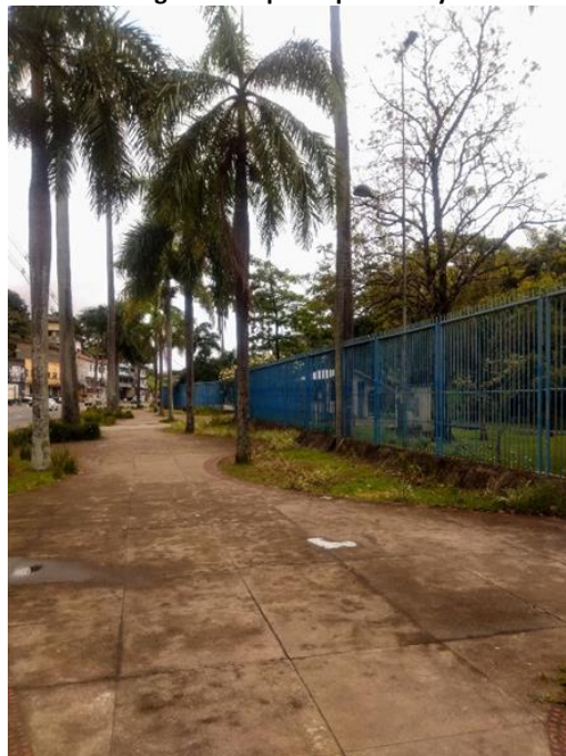
Figure 4: Imperial palm alley