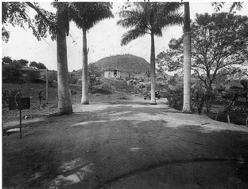
Figure 2: Garden of Maruípe - approximately 1930s

Again Sampaio states that the old garden was opened in 1938 and ornamental plants were produced on the site for use in squares, flowerbeds and avenues in the city. Since this period, the beauty of the garden has attracted people to stroll and visit (SAMPAIO, 1998, P. 11). According to Ventura and Girelli, the Maruípe garden was named Maruípe Agricultural Institute and started its activities in 1930. (VENTURA e GIRELLI, s / d, p 2-3).