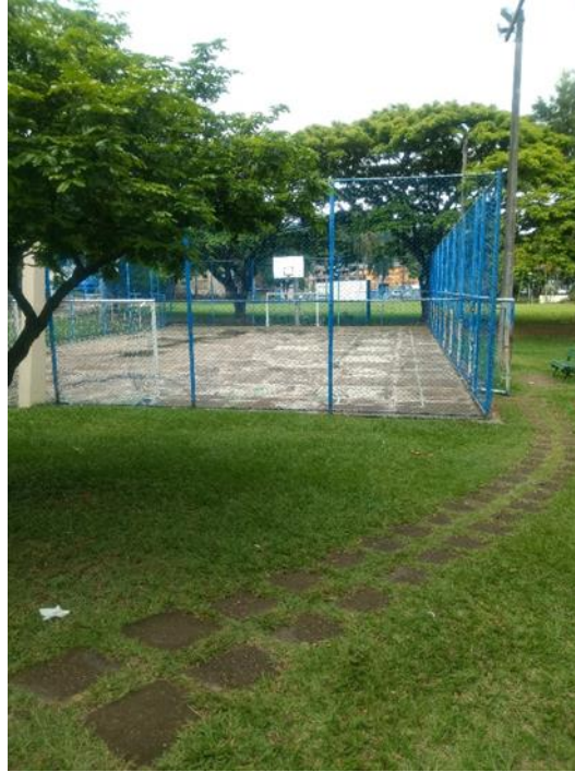
Figure 9: Horto de Maruípe Municipal Park - Sports Court

from view (often used by couples or illegal acts) was observed, in addition to this, appropriation with the water element and registers the wish that the sports court was covered for better conditions of use, hot days and rainy days. (ARAÚJO and CASER, 2012, p. 1-13).