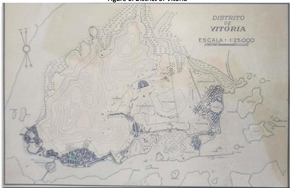
Figure 1: District of Vitória