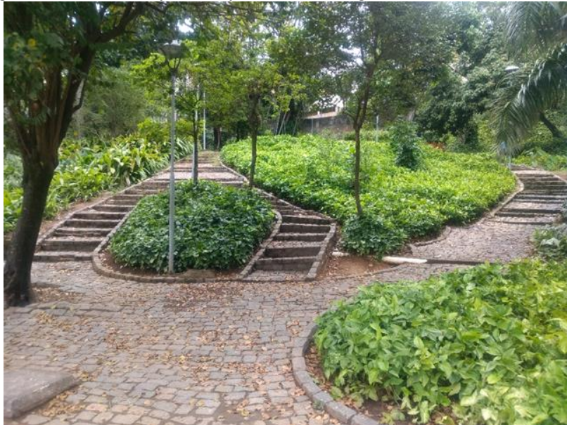
Figure 7: Horto de Maruípe Municipal Park - stairs to gates - Ariovaldo Bandeira Street

The tortuous paths and irregular stones on the pavement reinforce the inspiration (figure 7). The garden area, which is located between Avenida Maruípe and Rua Ariovaldo Bandeira, has two gates on the wall, which face the street, in order to invite the community to enter.