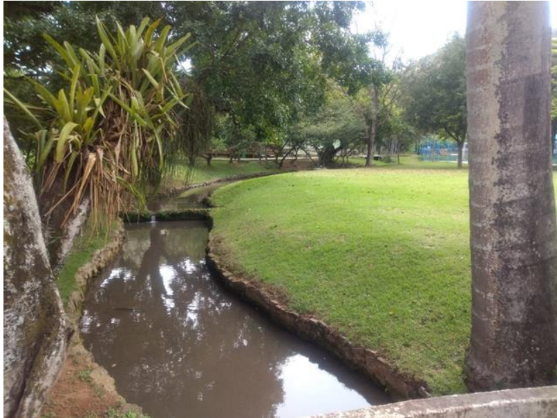
Figure 6: Horto de Maruípe Municipal Park - canal

Janeiro such as the Passeio Público, Campo de Santana and the Palácio do Catete Gardens. Eclectic inspiration can be seen in the image below (figure 6).