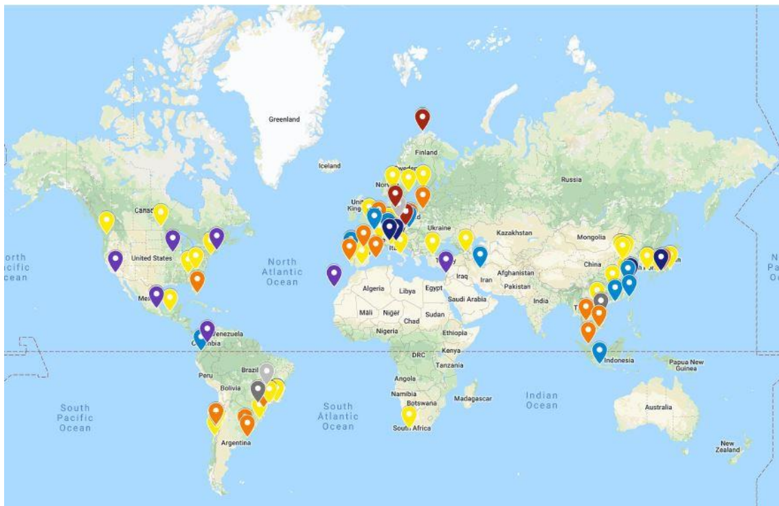
Figure 2: World map with geographically referenced works

In terms of geography, the works have some concentrations that were already expected by the author. Due to the origin of the portals and the languages in which they publish, there was coverage of 36 countries, some of them with higher concentrations, as can be seen in figure 2.