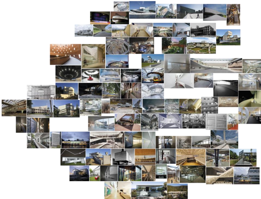
Figure 4: Atlas of selected works