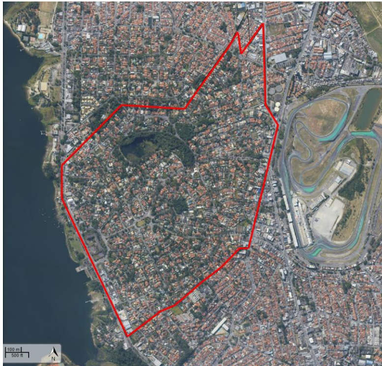
Figure 4. A 2017 photo of the area shows the layout within the perimeter in red, which corresponds to Interlagos district.