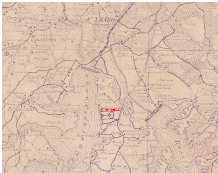
Figure 2. Detail from the 1944 map picturing São Paulo and its surroundings, showing the district of Interlagos between the Guarapiranga lake to the West and the Rio Grande lake or Jurubatuba to the East, today called Billings Dam.