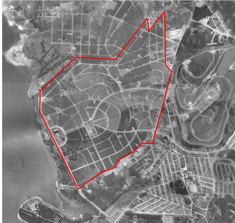
Figure 3. A 1954 orthophoto showed few houses built within the perimeter in red, which corresponds to Interlagos District.

Despite the apparent success in selling the parcels, a 1954 orthophoto showed that less than 30 houses had been built in the neighborhood. Also, it showed that the roadway system in the southern part of the development was different from Alfred Agache's original proposal (Figure 3).