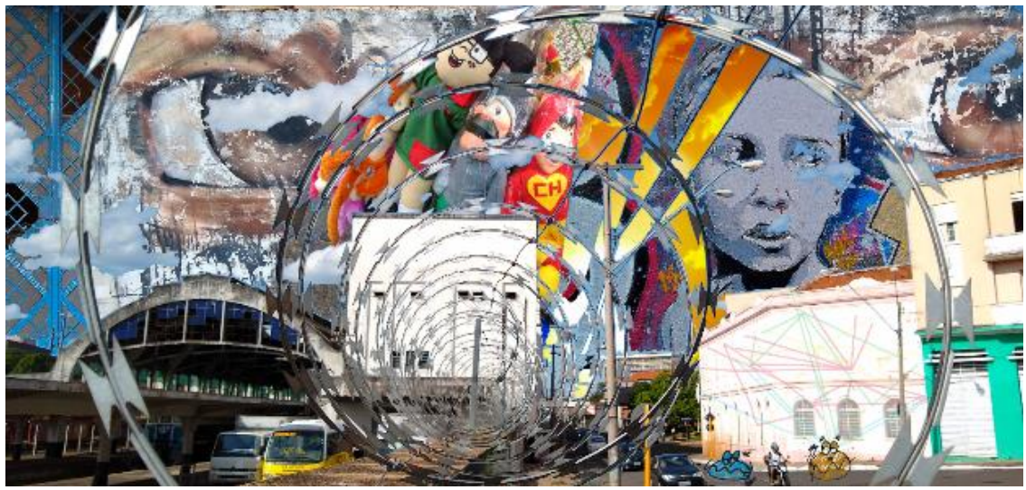
Figure 2 – Illustrative photomontage of heterotopia

Figure 2 refers to a photomontage elaborated from the perception of confluence and overlapping of different activities and spaces within the railway bed.