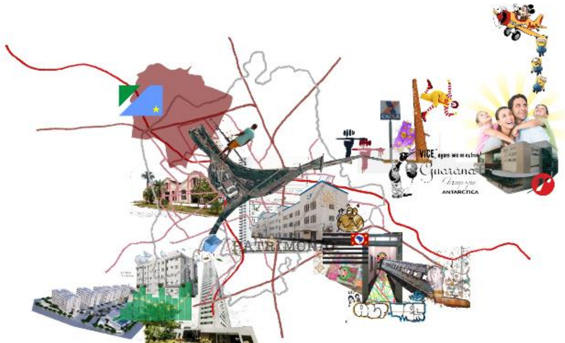
Figure 4 – Cartography of the railway

Figure 4 brings the cartography originating from the route taken for this work and others carried out previously, being part of a broader research still unfinished. Cognitive mapping reveals itself as a singular expression within the research modality delimited here.