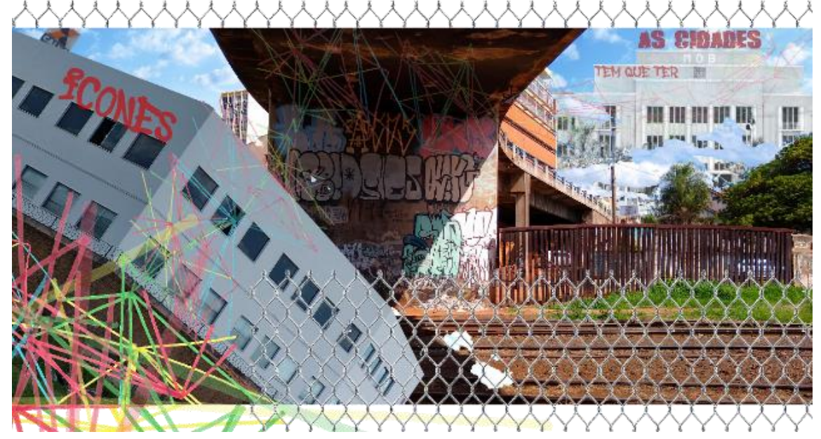
Figure 3 – Photomontage of overlapping temporalities and connections

In this sense, Bauru's iron bed can be considered a crisis heterotopia, as formulated by Foucault (2009), as it is a place for the leftovers of society, that is, for a portion of the population that are, in relation to the society, in a crisis situation: homeless, drug users, wanderers. But the concept of diversion heterotopia is also perceived: abandoned wagons are housing. Both inside and below, the space between the tracks and the car. The viaducts and bridges that overlap the iron bed cover immense areas that accommodate the homeless. Figure 3 is another illustration of the heterotopia present in the space of the iron bed.