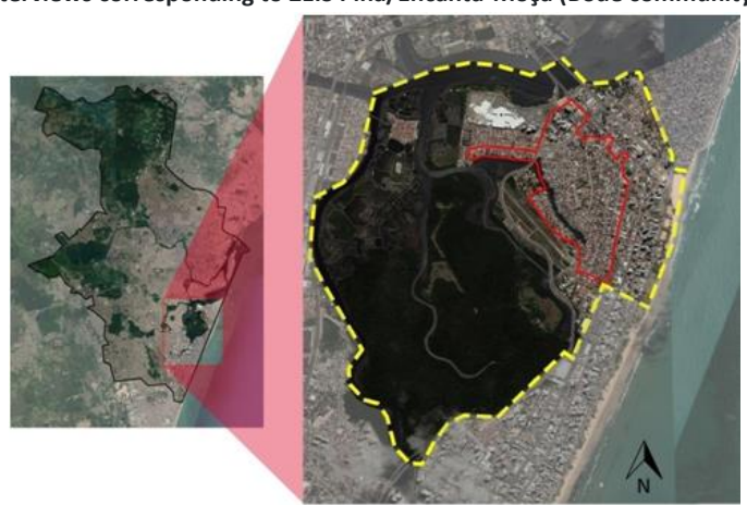
Figure 1 - Delimitation of the study area. In yellow, limits of the Pina neighborhood; In red, the perimeter of the interviews corresponding to ZEIS Pina/Encanta-Moça (Bode community).

These individuals inhabit the area investigated shown in Figure 1. Of the total, 3 of the interviewees work as fisherwomen and fishermen in the region, harvesting seafood directly from the Mangrove, while the others work on various activities related to the service or trade sector. In addition, 6 declared to have Incomplete elementary education, 2 declared to have completed elementary education, 3 declared to have completed high school and 1 declared to be attending higher education.