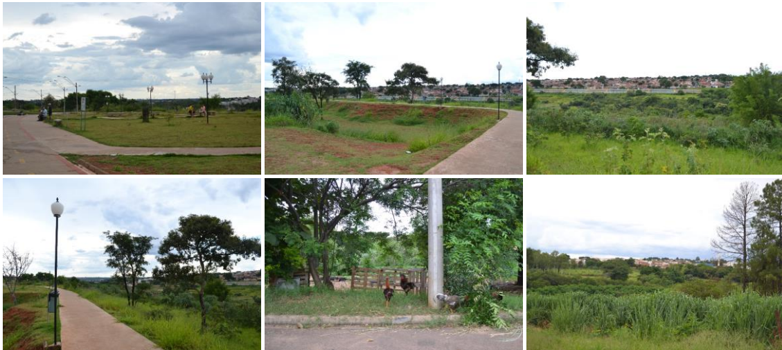
Figure 6: Public square around Avenida Jorge Zaiden and landscape potential in the area