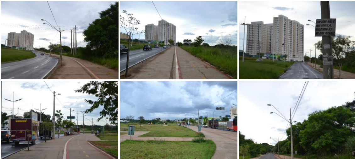
Figure 5: Jorge Zaiden Avenue and its surroundings