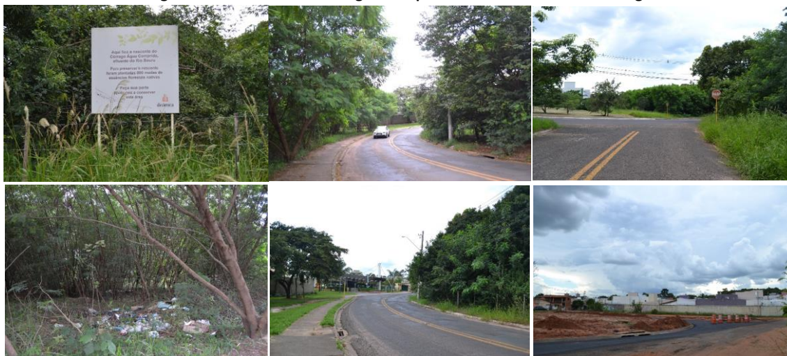
Figure 03: The source of the Água Comprida stream and its surroundings