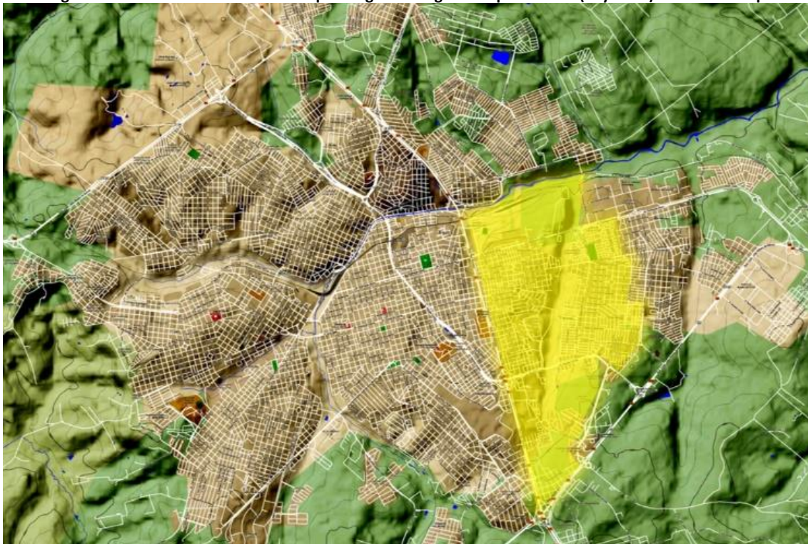
Figure 1: Administrative sector corresponding to the Água Comprida basin (in yellow) on a relief map