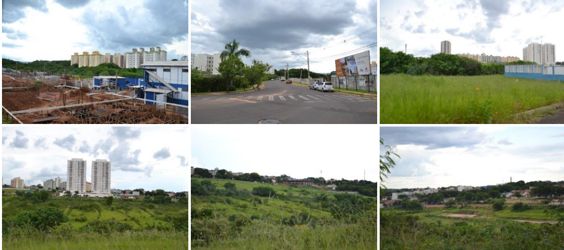
Figure 4: Real estate developments in areas adjacent to the Água Comprida stream

construction, close to the valley bottom, indicates the appreciation of the region and infrastructure projects in progress.