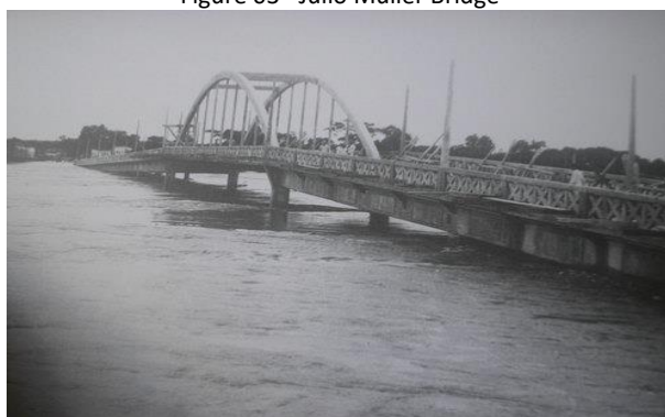
Figure 03 –Júlio Müller Bridge

This rivalry was more felt in the 20th century, especially during carnival, when the disputes between the carnival blocks of Porto, formed by blocks that paraded dancing through the streets, met with the "Corso Carnavalesco" of Cuiabá, formed by revelers who paraded in costumes. Their cars were decorated along 13 de Junho Street, between the city center and Rua Grande (Big Street) - XV de Novembro, in Porto.