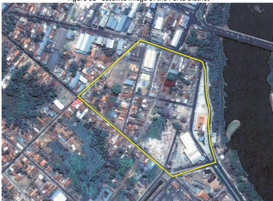
Figure 01 - Satellite Image of the Porto District

According to data from the IBGE Census (2010), in the area of 248 hectares occupied by the neighborhood, today 9274 inhabitants live.