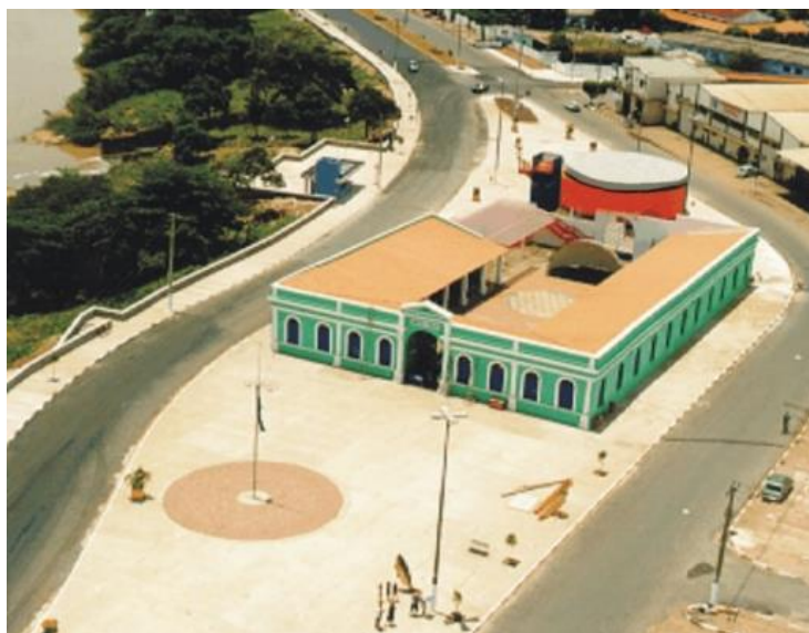
Figure 04 – Rio Museum and Municipal Aquarium (background)