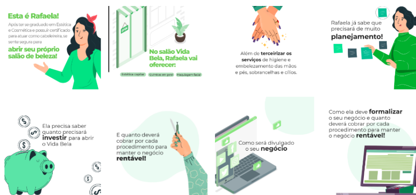
Figure 1 - Communication Model: Esperançar Project.