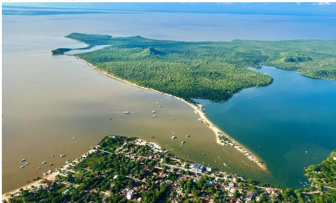
Figure 2 - Aerial photography records muddy waters of the Tapajós in contact with Lake Verde in Alter do Chão

communities and all the population of Lower Tapajós, due to the pollution caused by mining that affects not only Alter do Chão, near Santarém, but also good part of the aquatic life and everything that is consumed by the riverside population, causing serious health problems in all communities (Figures 2 and 3).