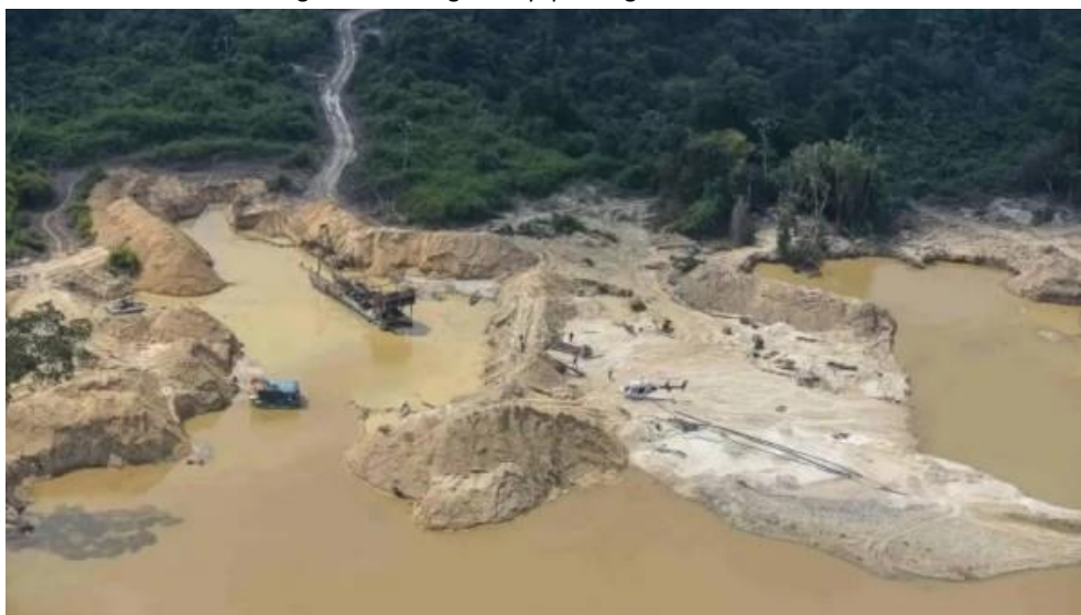
Figure 4 - Mining on Kayapo indigenous land - Pará