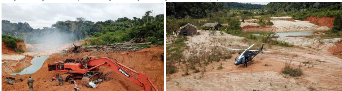
Figure 3- Figure 3- PF operation against illegal mining within the Tapajós Environmental Protection Area in 2022.