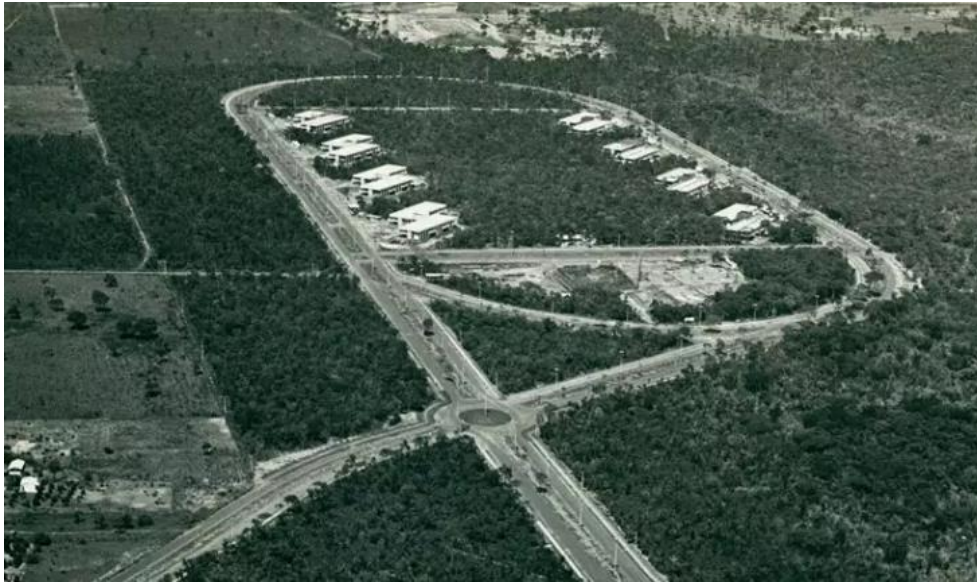
Figure 2 – Aerial view of the Parque dos Poderes: roads and buildings set in midst of the remnant forest