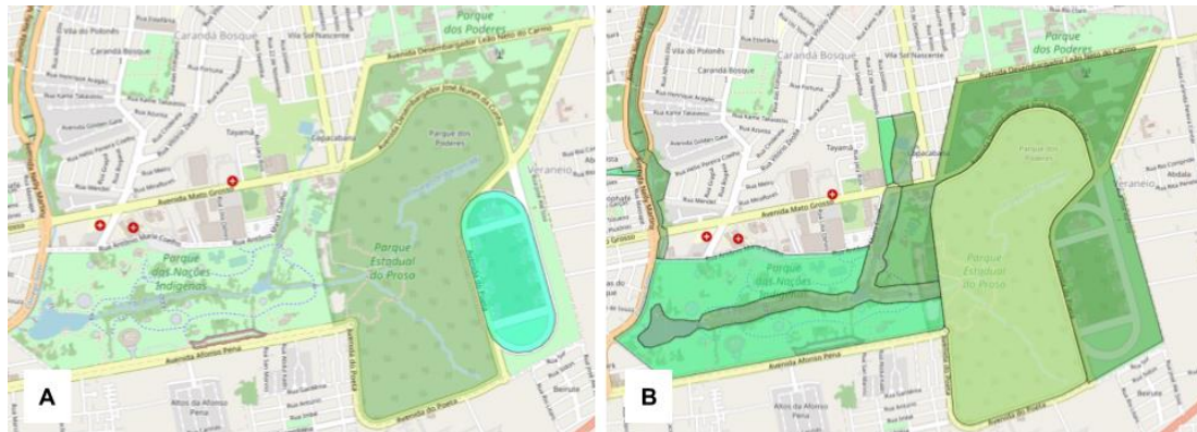
Figure 3 – ZEIC (A) and ZEIA (B) of the region of the Parque dos Poderes

Font: Adapted from the Municipal System of Indicators of Campo Grande – MS (SISGRAN). Available at: Sistema https://sisgranmaps.campogrande.ms.gov.br/ . Access on: April 1 st 2023.