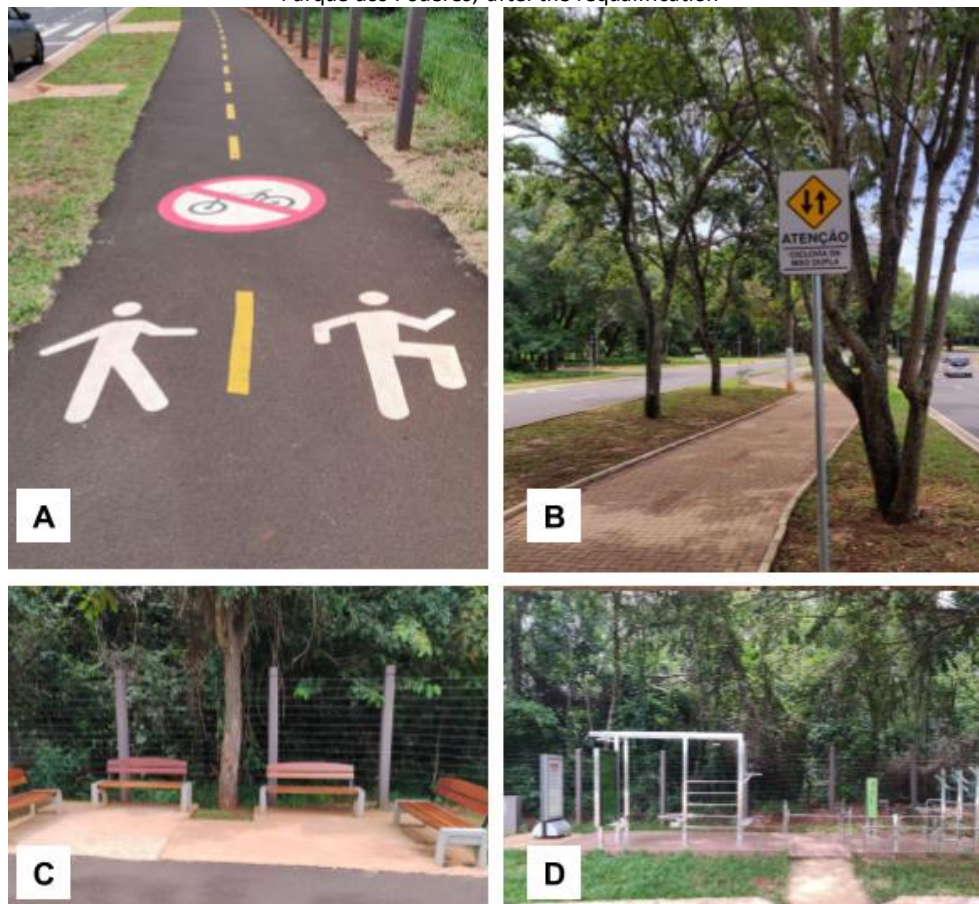
Figure 5 – Walking and running tracks (A), bicycle lanes (B), rest stops (C) and gymnastics station (D) installed in the Parque dos Poderes, after the requalification