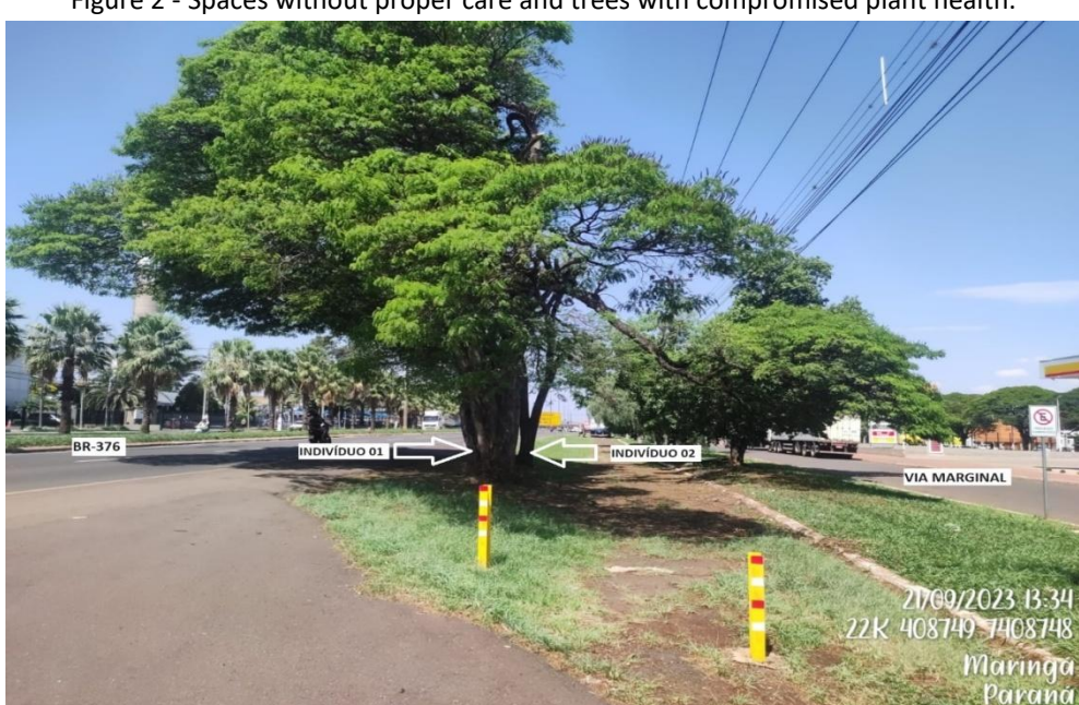
Figure 2 - Spaces without proper care and trees with compromised plant health.

The study was conducted along the right side of the BR 376 dual carriageway, which runs through the urban area of Maringá, between km 180+263 and km 180+416. The UTM geographic coordinates are as follows: initial point at 408750.00 m E and 7408742.00 m S; and final: 408882.66 m E and 7408663.70 m S. This area consists of neglected empty spaces (see Figure 02).